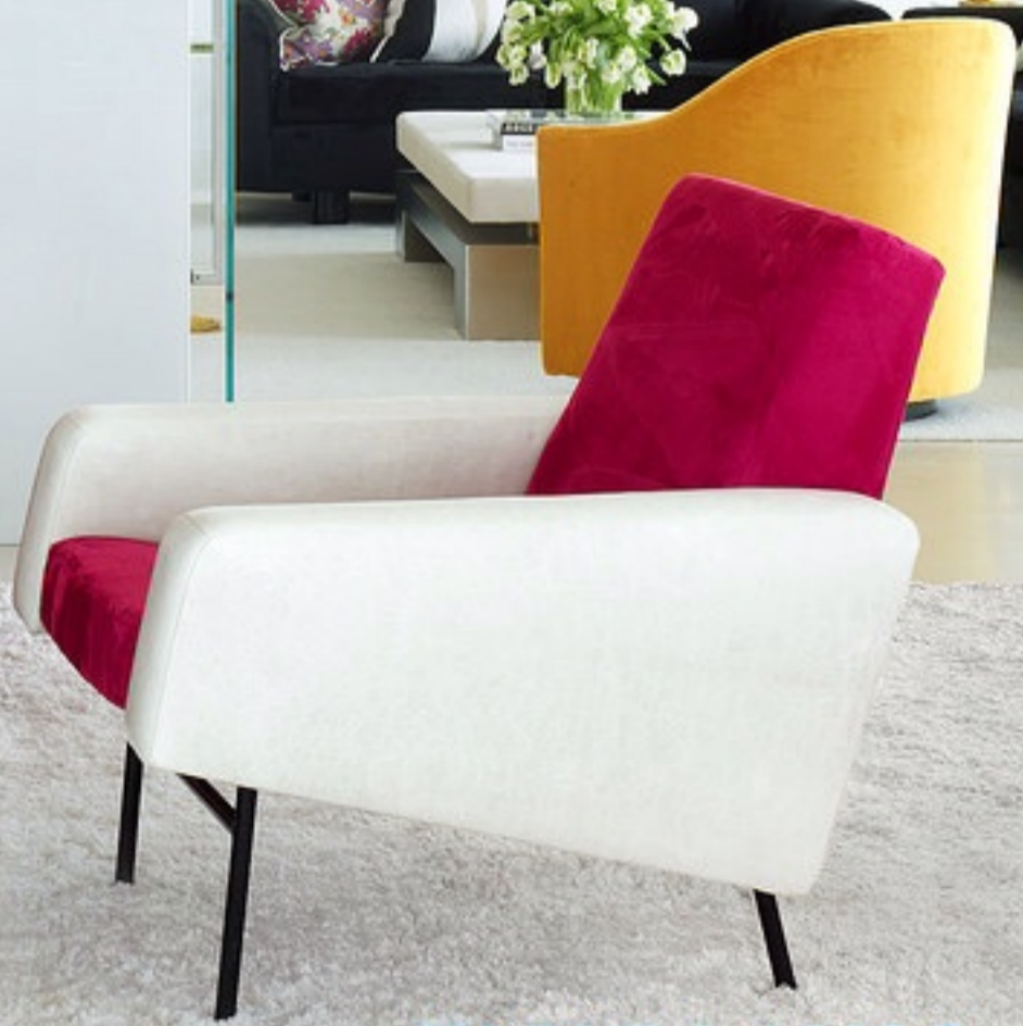
TABLE LAMPS, TILES, TEXTILES... ELEGANT UPDATES FOR EVERY ROOM